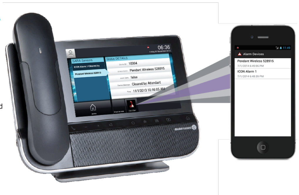
Send and receive SARA alerts from OpenTouch Cloud sets and mobile phones.